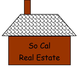
Make the right move

Note : Your text may look slightly different depending on the font you choose.